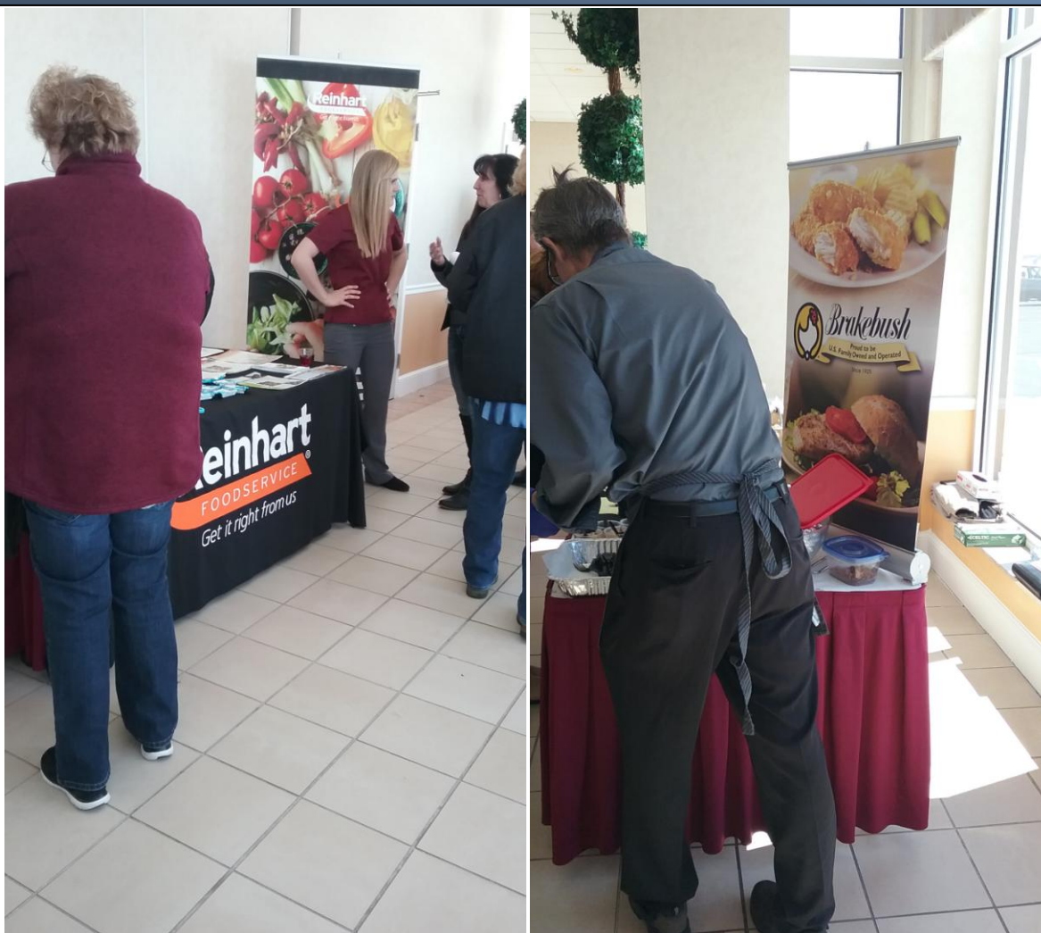
Wisconsin ANFP Spring Conference Vendor Showcase

Please mark in your calendars for Fall Meeting which will be held in the Dell's Sept 13th and 14th. I would love to hear how everyone celebrated National Nursing Home week. If you would like to share please send to any of us and we would love to spot light you in our newsletter that comes out monthly now. I hope everyone is enjoying that and we are keeping everyone more in the loop of what's happening in WI ANFP. Have a great Summer.