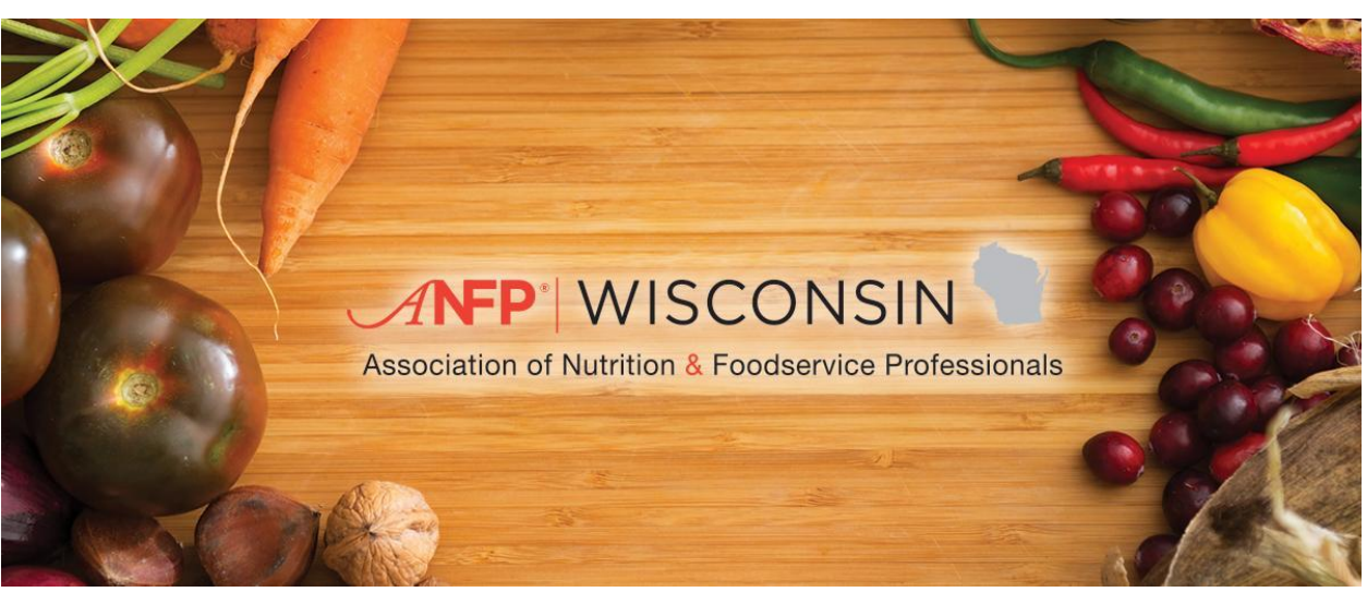
A Publication of the Wisconsin Association of Nutrition & Foodservice Professionals Issue No: 3 July 2021