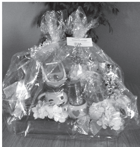
2017 basket shown included: Keurig® machine, k-cups®, emoji mugs, two bottles of wine, wine glasses and chocolate

Back by popular demand is the Cherished Hopes Bucket Draw. All baskets will be valued at $100 or more and will be displayed throughout the convention in the Bismarck Event Center lobby by the registration desk. Participants will have the opportunity to purchase tickets and place them in the bucket in front of the basket or baskets they would like a chance to win. Winners will be drawn Thursday evening and will be posted at the registration desk Friday morning. Winners do not have to be present to win.