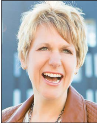
WEDNESDAY OPENING KEYNOTE 3:00 p.m. – 5:00 p.m. Better Together