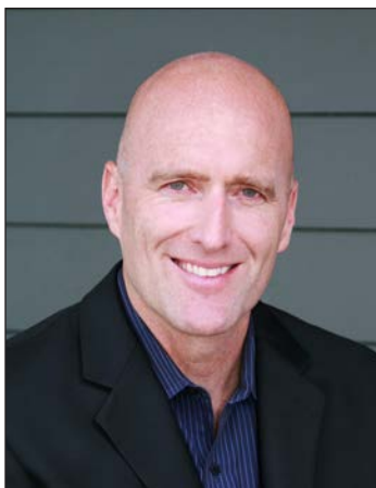
FRIDAY CLOSING KEYNOTE 10:45 a.m. – 12:30 p.m. The Intelligence of Fun... Creating a Work Culture with Staying Power

Identified as one of the Top 40 under 40 business leaders in the Midwest, The Business Watch magazine recognized this young entrepreneur for professional development, community contributions, and her influential voice that she calls The Business of Life.