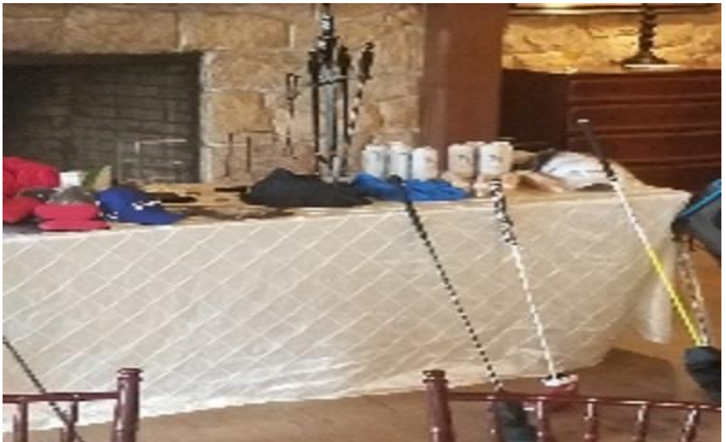
TABLE OF PRIZES AND GIFTS