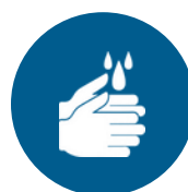
Sanitation & Safety