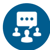
Personnel & Communications