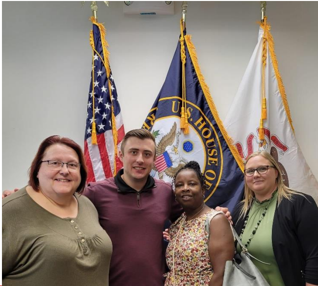
President, President-Elect, and Past President meet With designee from Goveners Office