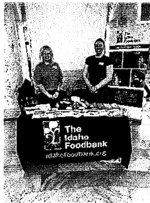
Idaho Food Bank