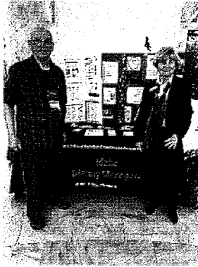
State Senator Janie Ward-Engelking – Boise