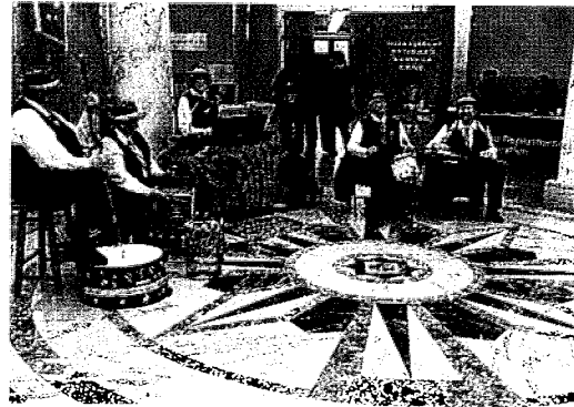
Prime Time Swingers