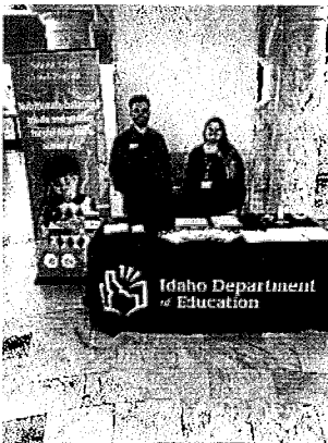
Department of Education School Lunch Program