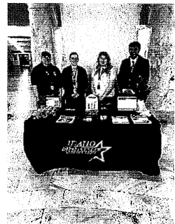
Department of Correction