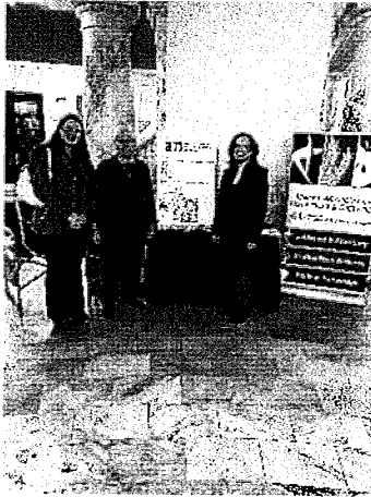
Academy of Nutrition And Dietetics