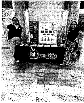
Eat Smart Idaho