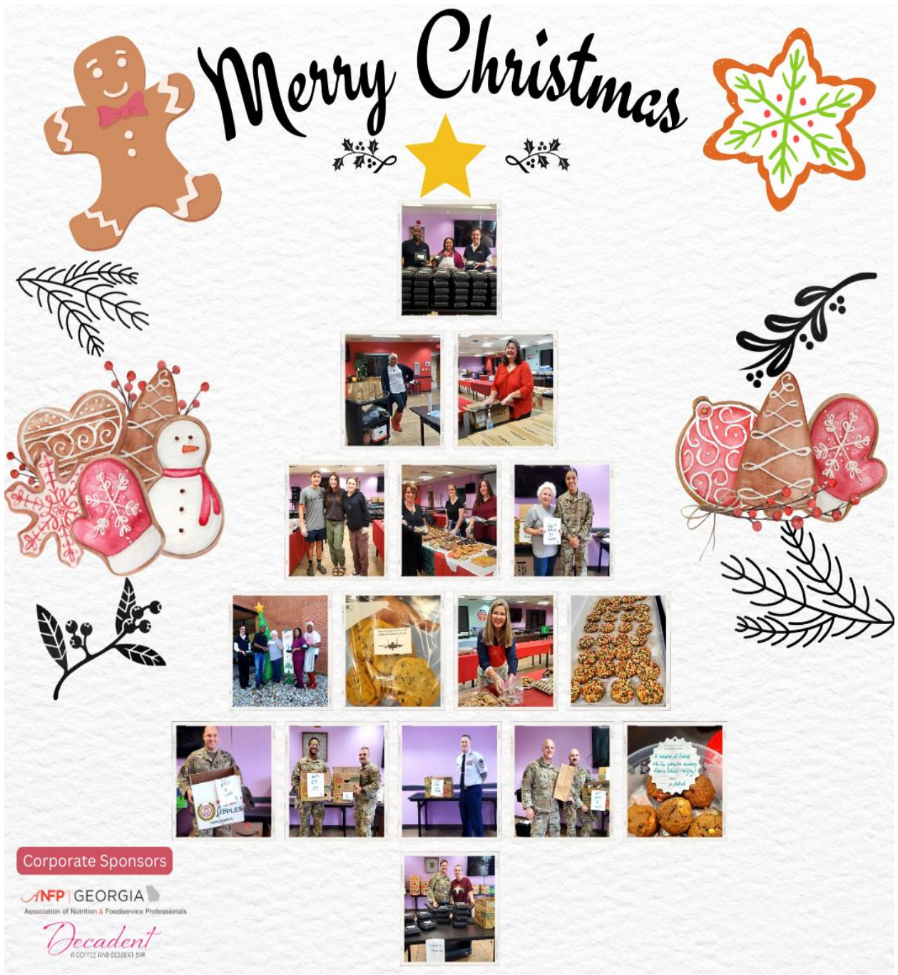
Cookie Drive photo 12/15/2022