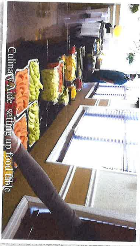
Culinary Aide setting up food table