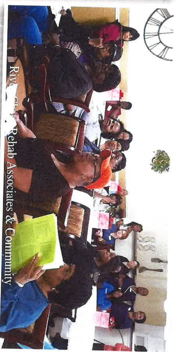
River Chase Rehab Associates & Community