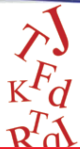
Table 2 Definitions:

Decisions around ANH involve the ethical principles of client autonomy, beneficence, and nonmaleficence. (See Definitions in Table 2.)