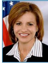
Lynn Jenkins (R-KS-02)

As the first co-sponsor of the 2015 Safe Food for Seniors bill, US Representative Lynn Jenkins (Kansas - 2nd district) continues to work with ANFP advocates. She is currently working to gain approval for the bill from the House Ways and Means Committee for sponsorship; it can then be reintroduced to Congress. Rep. Jenkins always opens her door in Kansas and in Washington, DC, to ANFP staff and volunteers to discuss this important issue involving the elderly population.