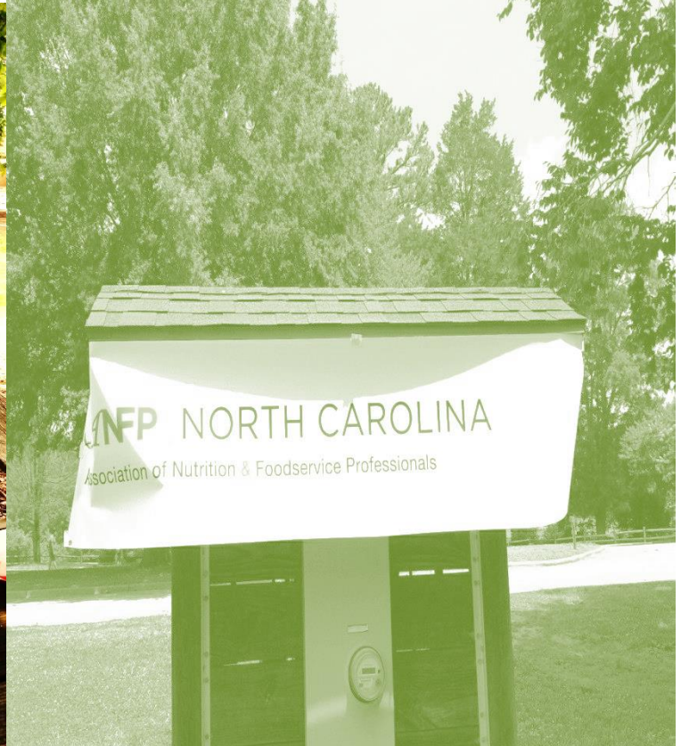
THE FIRST EVER--- NC ANFP Members enjoy FAMILY FUN DAY, June 16, 2018 at High Point Lake Park, Jamestown, NC