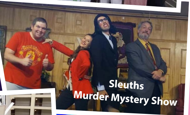
Sleuths Murder Mystery Show