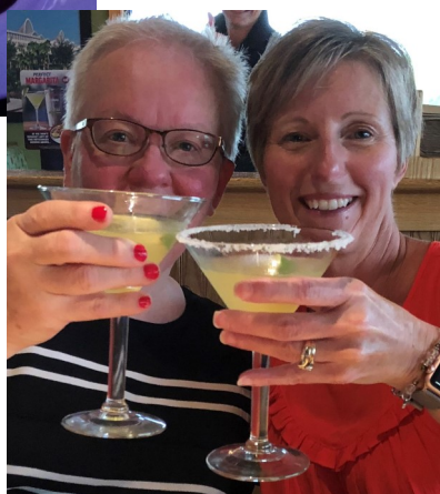
Fabulous Food & Presentation