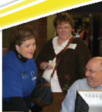
Simply Menus web based management tool