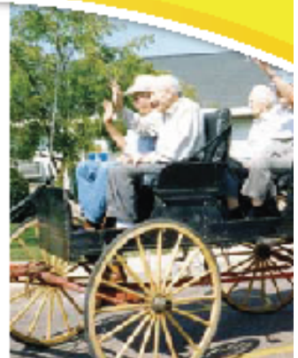
Theme Meal Magic - online meal & event planning

At Martin Bros., our goal is to create inspirational and innovative solutions that serve our foodservice partners – specific solutions for specific customers. Healthcare customers can expect Martin Bros. advantages that take them above and beyond in the healthcare industry.