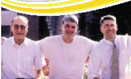
Third generation, family owned company