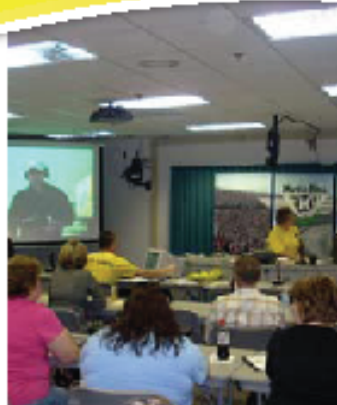
Fun, education CEU's - come join us!