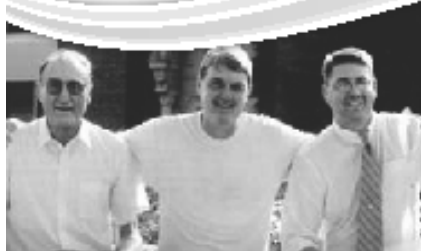
Third generation, family owned company