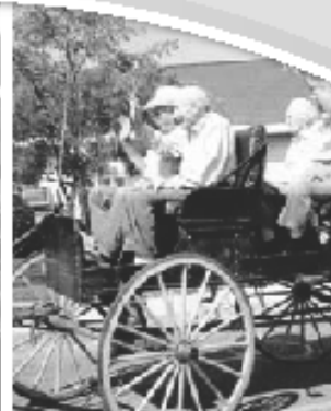
Theme Meal Magic - online meal & event planning

At Martin Bros., our goal is to create inspirational and innovative solutions for our healthcare partners.