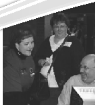
Simply Menus web based management tool