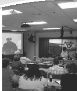
Fun, education CEU's - come join us!