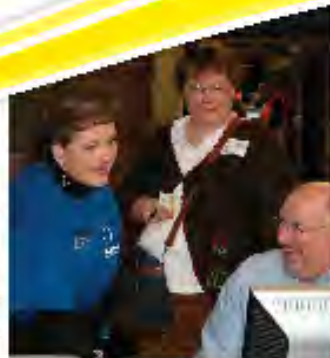
Simply Menus web based management tool