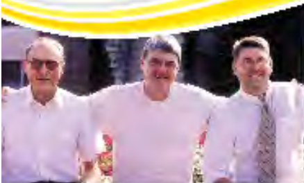
Third generation, family owned company