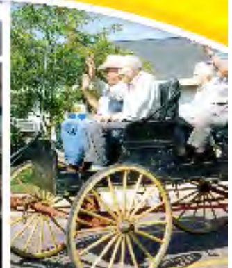
Theme Meal Magic - online meal & event planning

At Martin Bros., our goal is to create inspirational and innovative solutions for our healthcare partners.