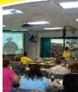
Fun, education CEU's - come join us!