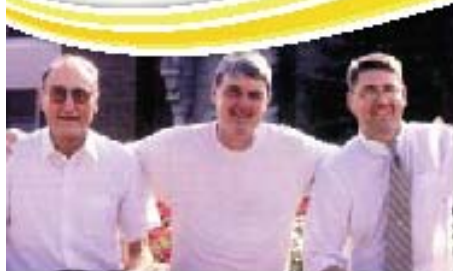
Third generation, family owned company