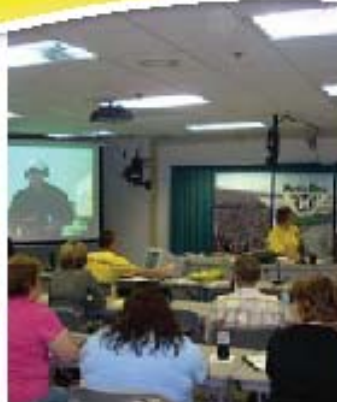
Fun, education CEU's - come join us!