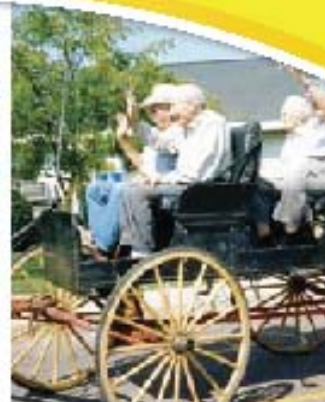
Theme Meal Magic - online meal & event planning

At Martin Bros., our goal is to create inspirational and innovative solutions that serve our foodservice partners – specific solutions for specific customers. Healthcare customers can expect Martin Bros. advantages that take them above and beyond in the healthcare industry.