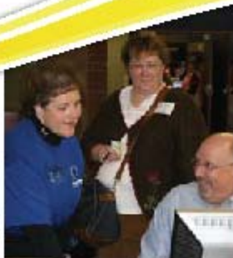
Simply Menus web based management tool