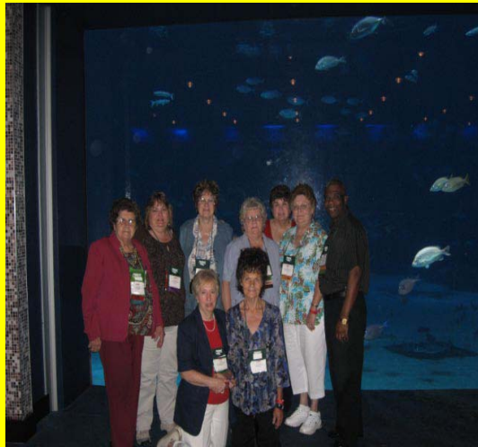
Trip to the Aquarium