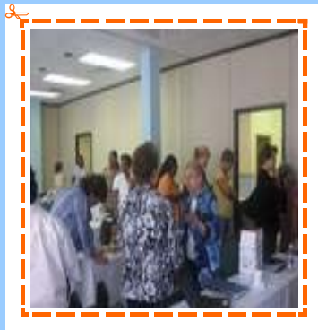
Members & Guest