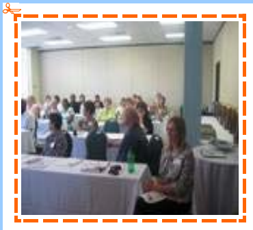
Members & Guest