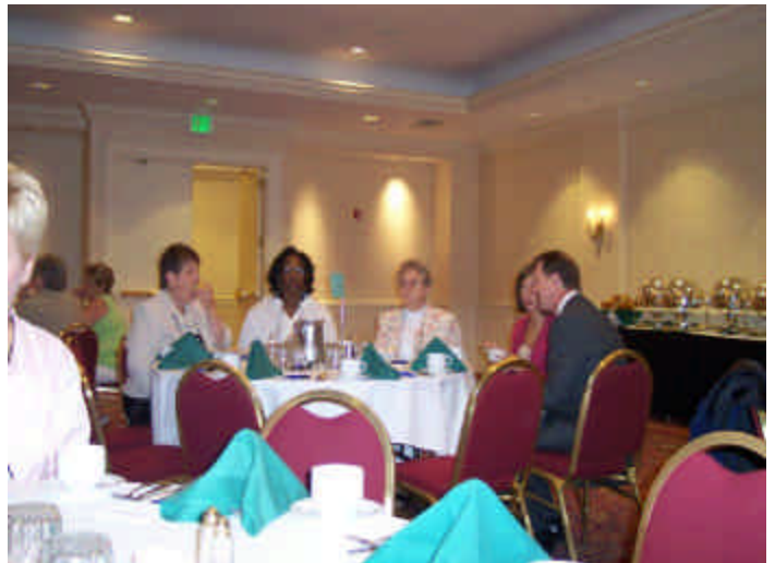
National Chairman Working Breakfast