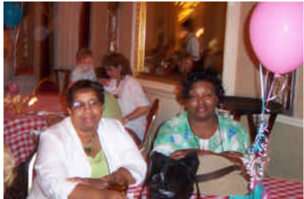
Friendship and Fun