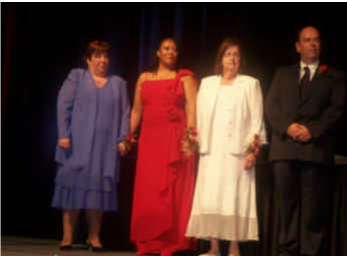
New Directors at Large